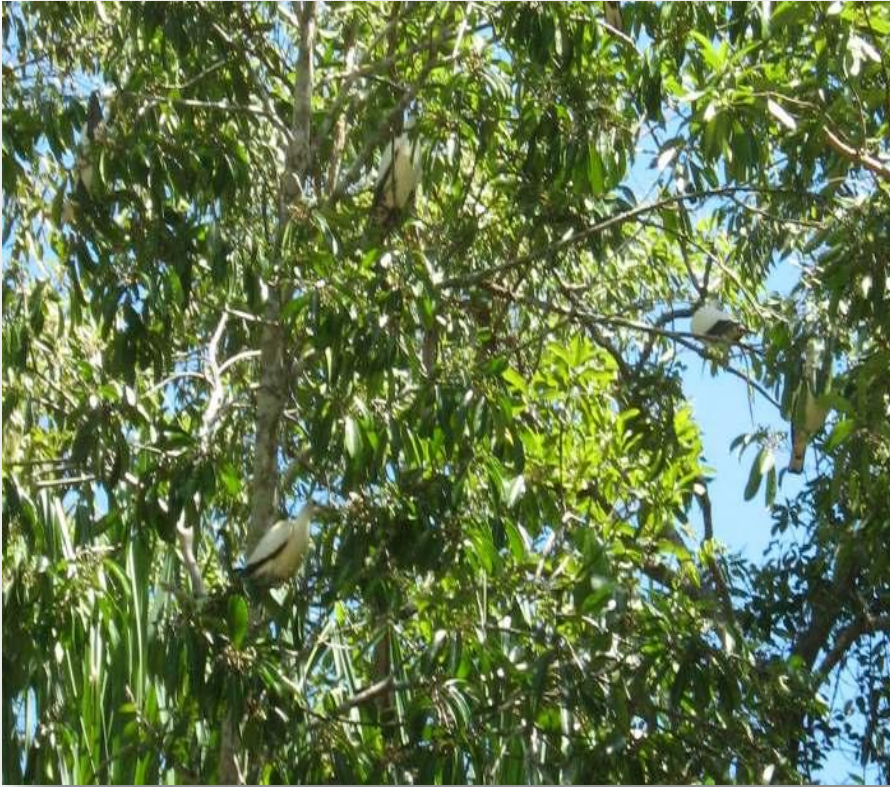
VETTI ( Aporosa lindleyana )