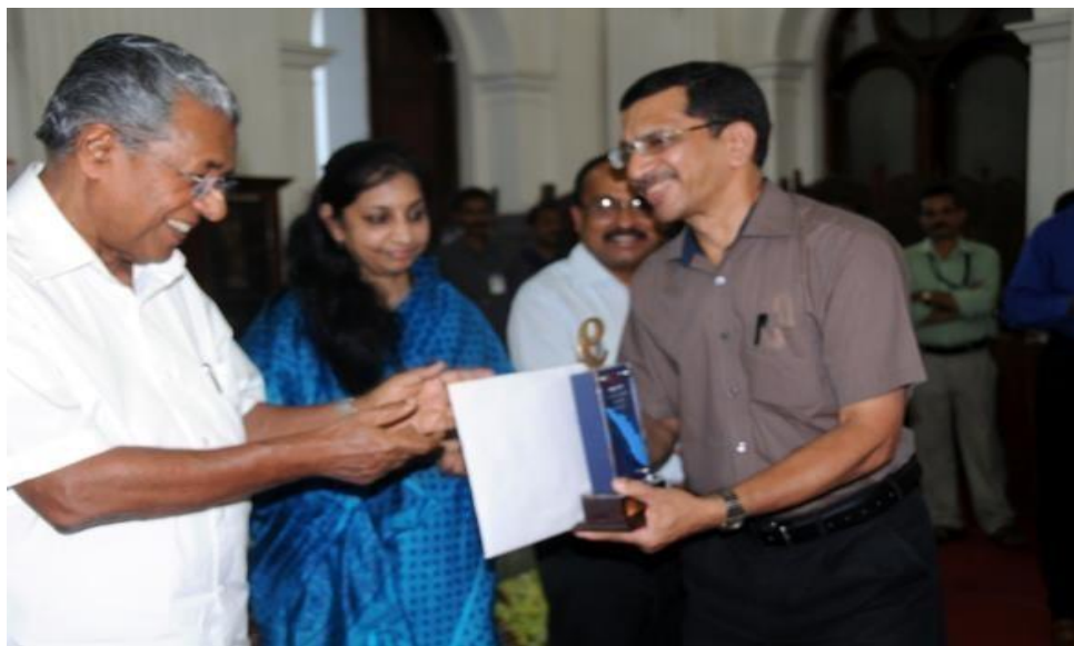
Figure 1 - Head of Forest Force received e-Governance award from Honorable Chief Minister

Kerala State Forest Department bagged the second position in the State e-Governance Award