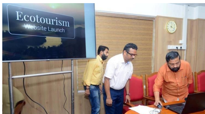
Ecotourism website launch by Tourism Minister Kadakampally Surendren at minister's Chamber

Online Ticket Booking facility was started for the visitors visiting various Ecotourism destinations in the State