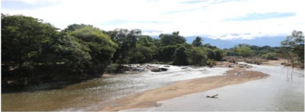
Karimpuzha in Malappuram district is declared as a new Wildlife Sanctuary

In a first of its kind anywhere in India, Kerala Forest Department has erected a new kind of fencing the "Crash Guard Steel Rope Fencing" which could reduce Human-Elephant conflict to a large extent.