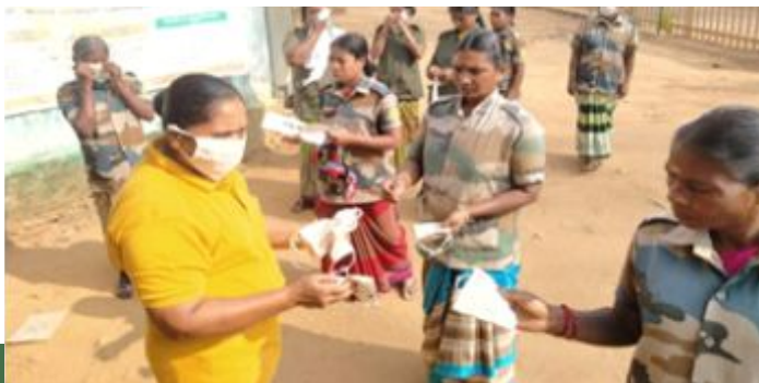
Awareness Creation among Tribals