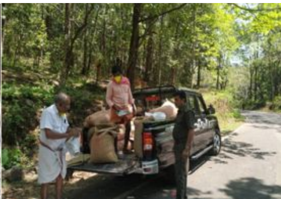
Carrying Ration to inaccessible Supply of aid to tribal communities