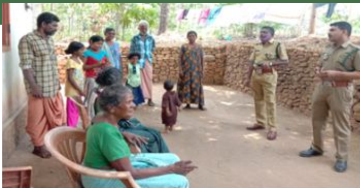
Awareness Creation among Tribals