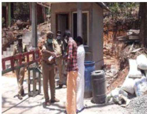
Ensuring sanitation at Check posts